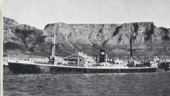
The Clan Kennedy, sold for breaking up in Taipei (Formosa). Built in 1942 as the Ocean Viscount