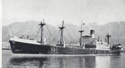
The Drakensberg Castle, sold for breaking up in Hong Kong. Built in 1945 as the Empire Allenby