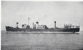
The King Edgar. Sold for breaking up in Japan. Built in 1945 as the Empire Gambia