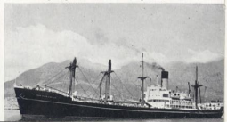
The Good Hope Castle, sold for breaking up in Hong Kong. Built in 1945 as the Empire Life